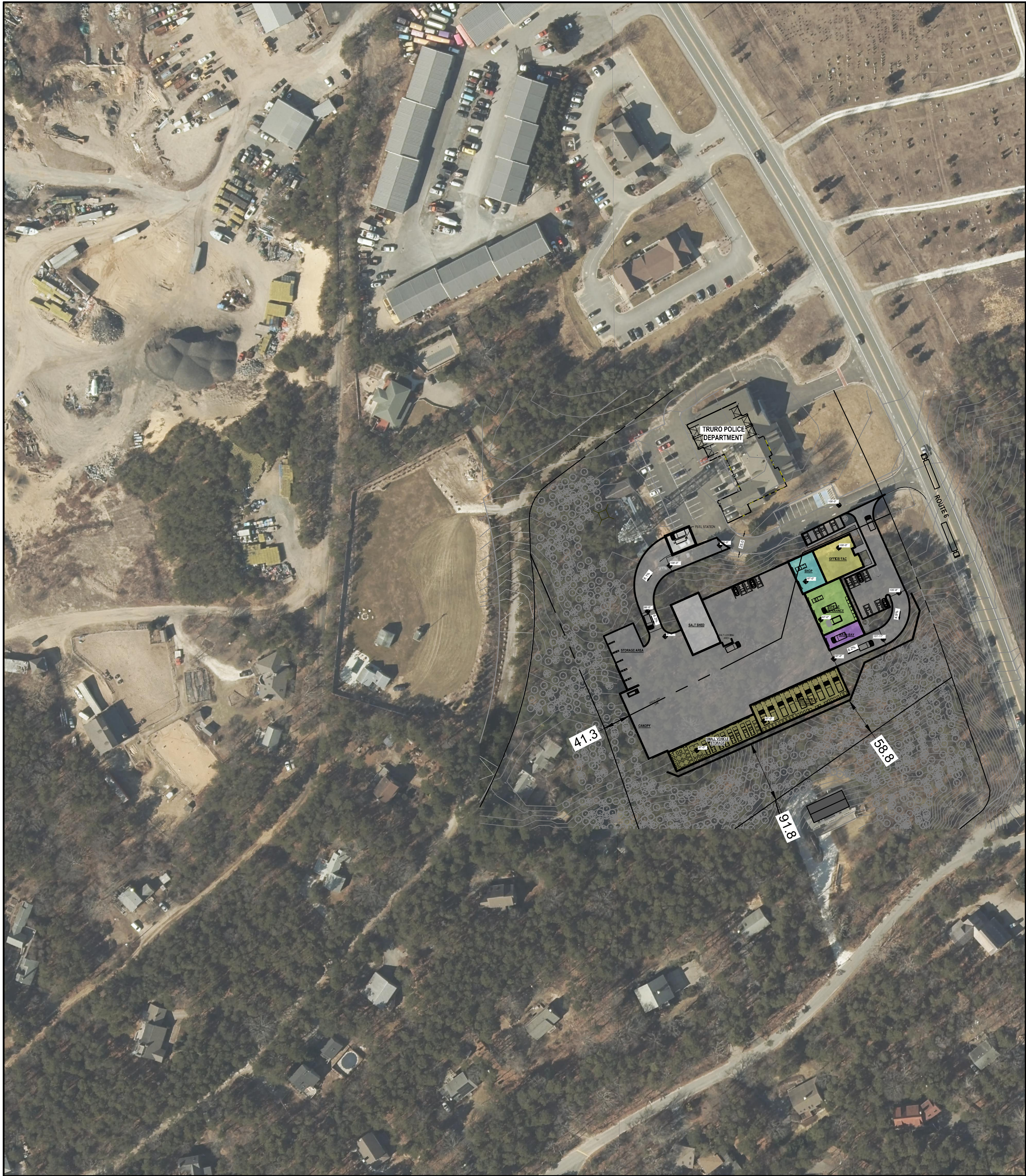
SITE LAYOUT - OPTION 1