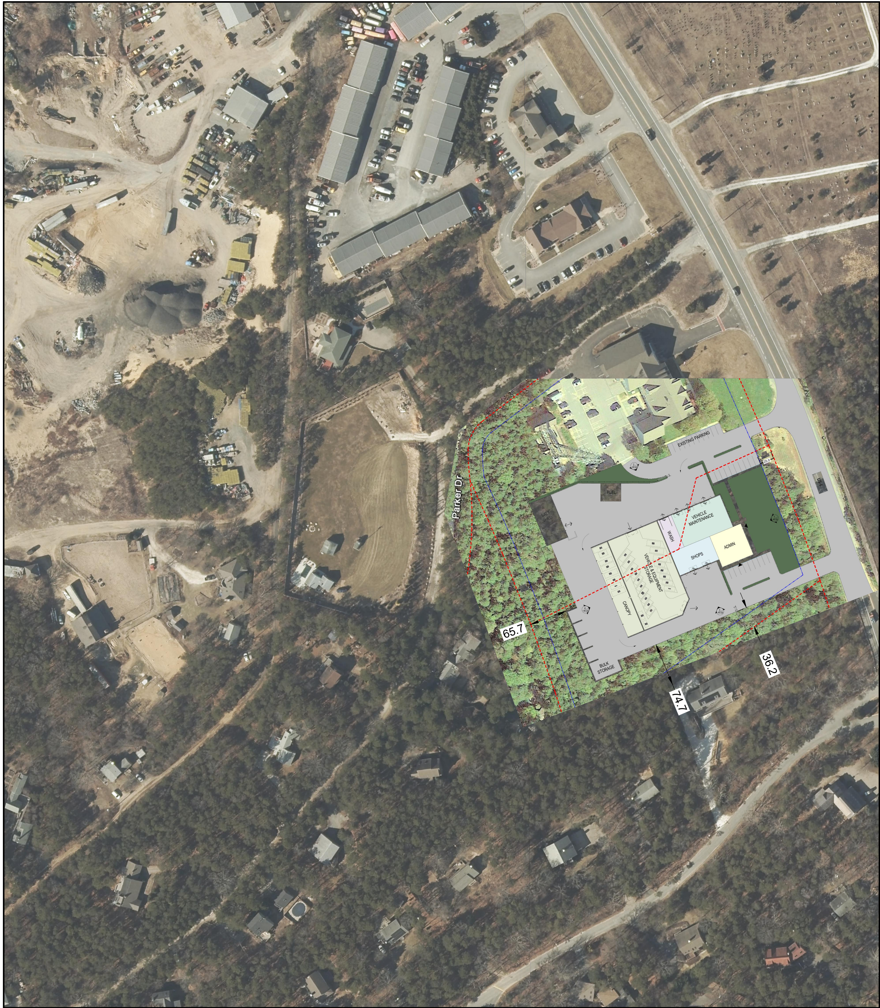
SITE LAYOUT - OPTION 2